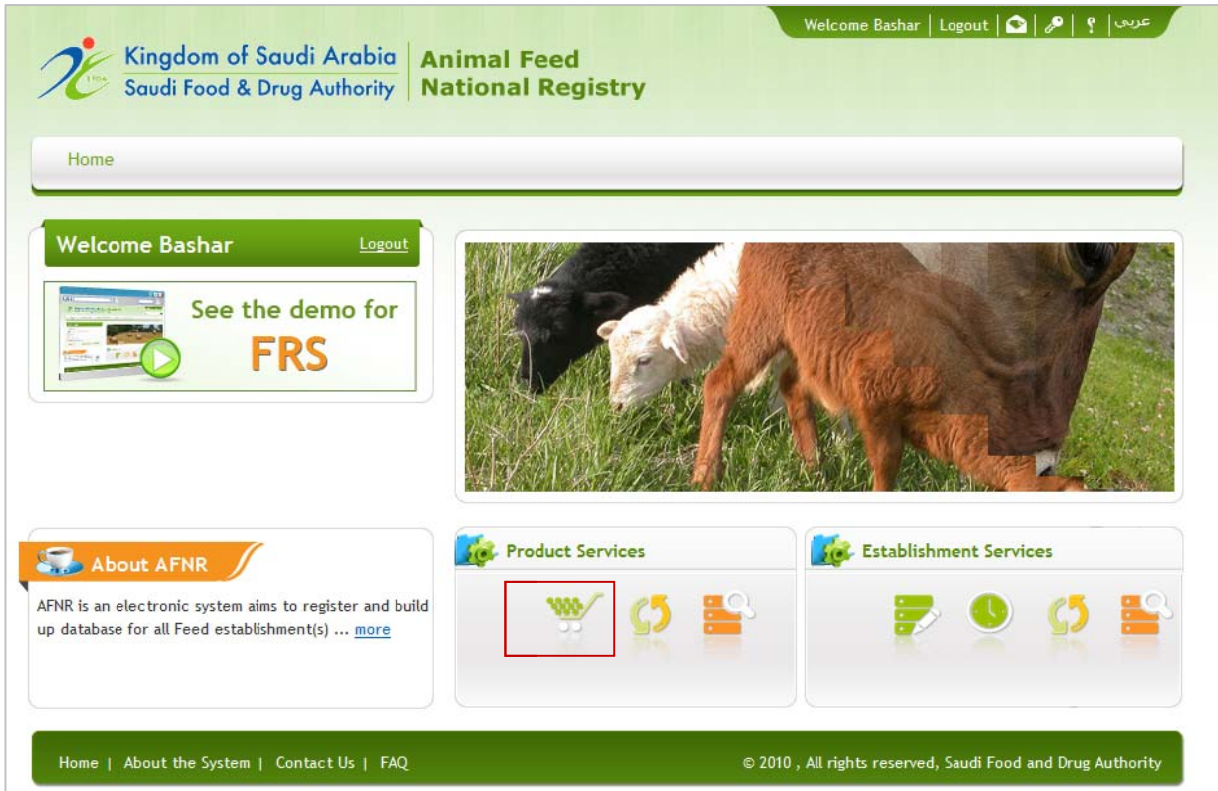
Figure 21 : Feed Subsystem Home Page with Register Product link

Product Registration process requires from the user inserting some detailed information about the registered product. This information is divided into four main categories that exist mainly in the online registration request which we will discuss in this section. The user has to specify initially the product type by selecting that among the available product categories, and based on the product group he should insert the product details.